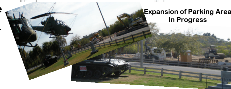
Expansion of Parking Area In Progress